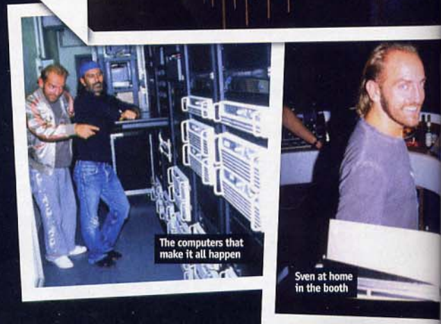
The computers that make it all happen