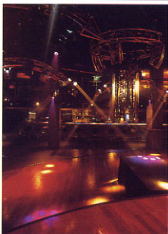
TOP LEFT & BOTTOM RIGHT: THE IAN MESSNER DESIGN RIG WITH CM LODESTAR MOTORS TOP RIGHT: THE CROWN AMP RACK BOTTOM LEFT: BOHEM RESTAURANT